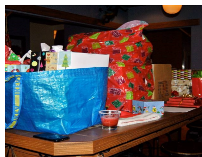
Holiday gifts for deserving families!