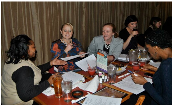
Several NDYP members enjoy socializing, while planning 2014 projects and activities!

Be sure to check out NDYP's Taste of Ohio Beer Tour hosted by Eldorado's Bar at 6:00p.m. on March 27 th . The event will provide ticket purchasers with the opportunity to taste different beers from breweries around the state. In addition to the beer tasting,, there will be a food truck providing goodies for people to purchase, local bands providing free entertainment, and a silent auction that will benefit the programs and services of NDCC.